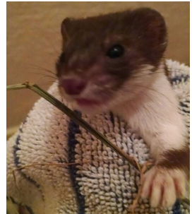
A least weasel that was caught by a cat in early 2015. He was returned to the wild after 6 weeks in rehab.

As the demand for our services increases, we are continuing to grow to meet the need in our community. We have big plans for the future, but we need your help to get there. We've included more about our vision and how we hope to get there here as well.