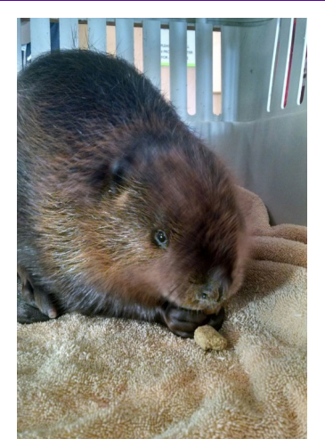
Little beaver on moving day

Last fall, we received a call from our friends at the Wildlife Rehabilitation Center of Minnesota asking if we could help rehabilitate a young beaver they'd received. Although they are a top-notch facility, they don't have the space to care for the baby beaver for the two years it will take before she can be released back into the wild. They knew that we have successfully raised several beavers in the past and hoped we could help with this one. We knew immediately that we wanted to help — if we didn't, it was likely she would end up in a zoo or other captive situation. After receiving approval from the states of Nebraska and Minnesota, NWRI volunteers drove to Minneapolis to pick her up. She is now residing happily in her "beaver palace" in the woods, and will be released back into the wild in Minnesota in 2016.