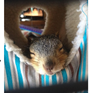
Above: Baby squirrel hanging in his hammock, Below: Baby raccoon—Both animals were rescued through NHS this year.

overwhelming profile of NHS means that more animals can be saved each year. NHS has officers on the road who pick-up wildlife in need and full-time dispatch employees who handle calls from the public every day. Although NWRI's volunteers staff a wildlife hotline and pick-up animals, NHS has a much larger capacity to do this work. NHS also provides a high-profile, central drop-off location for wildlife. Given that NWRI's volunteer resources are finite, having the staff at NHS on our side picking up wildlife