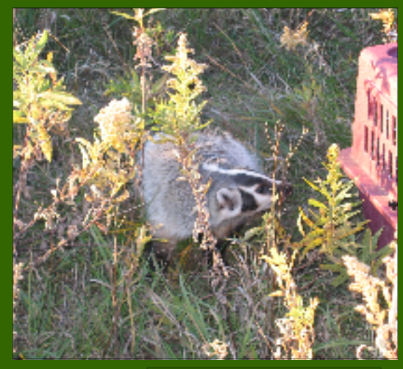
Above: Adult female badger Below: 3-week old raccoon Left: Fox squirrel