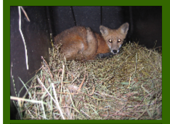
Above: Female fox in care during mange