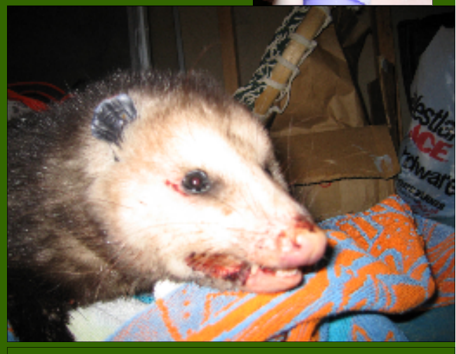
Above: This adult male opossum suffered severe facial injuries when he tried to escape from a live trap.