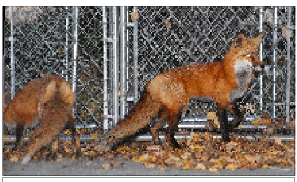
Top: The healed foxes in their wilding cage, late fall (Female left, male right)

Almost every year, NWRI takes in orphaned and wilding facility, both foxes were released together on