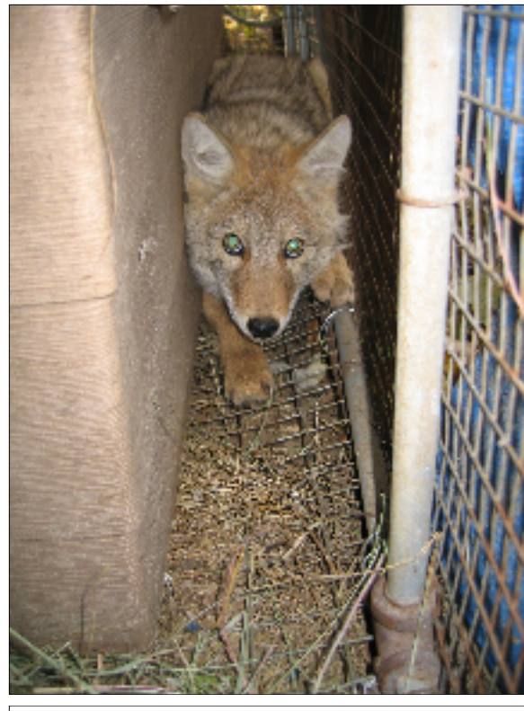
A young coyote rescued from North Platte, NE Summer 2007